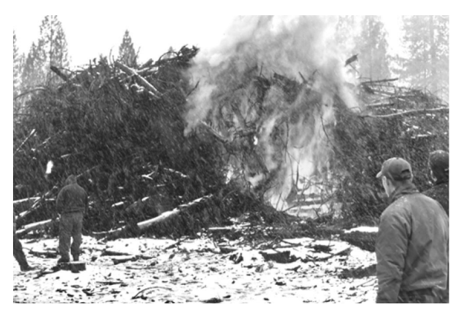
Figure 1. Open pile burn of forest fuel treatment woody biomass in Lake Tahoe Basin.

The Placer County Air Pollution Control District (PCAPCD), with responsibility for managing air quality in Placer County, shares regulatory authority over open burning with local fire agencies. Open burning is problematic because of the limited time of year it can be conducted, subsequent monitoring of smoldering piles for days after they are lit, and the production of significant quantities of air pollutant emissions and esthetically unpleasing residuals (blackened logs and woody debris). The PCAPCD expends significant resources reviewing smoke management plans, issuing burn permits, inspecting burn piles, and responding to complaints from smoke.