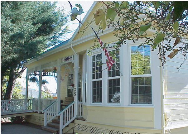
Emergency Shelter – Jackson, California

Requiring a variance, minor use permit, special use permit or any other discretionary process does not constitute a non-discretionary process. However, local governments may apply non-discretionary design review standards.