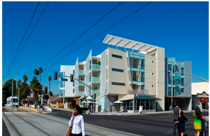
Gish Apartments – Supportive Housing, San Jose, CA

Effective programs reflect the results of the local housing need analyses, identification of available resources, including land and financing, and the mitigation of identified governmental and nongovernmental constraints. Programs consist of specific action steps the locality will take to implement its policies and achieve goals and objectives. Programs must include a specific timeframe for implementation, identify the agencies or officials responsible for implementation, and describe the jurisdiction's specific role in implementation.