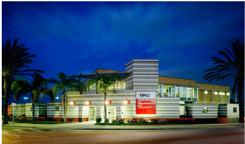
Cloverfield Services Center – Emergency Shelter by OPCC in Santa Monica, CA

Prior to enactment of SB 2, housing element law required local governments to identify zoning to encourage and facilitate the development of emergency shelters. SB 2 strengthened these requirements. Most prominently, housing element law now requires the identification of a zone(s) where emergency shelters are permitted without a conditional use permit or other discretionary action. To address this requirement, a local government may amend an existing zoning district, establish a new zoning district or establish an overlay zone for existing zoning districts. For example, some communities may amend one or more existing commercial zoning districts to allow emergency shelters without discretionary approval. The zone(s) must provide sufficient opportunities for new emergency shelters in the planning period to meet the need identified in the analysis and must in any case accommodate at least one year-round emergency shelter (see more detailed discussion below).