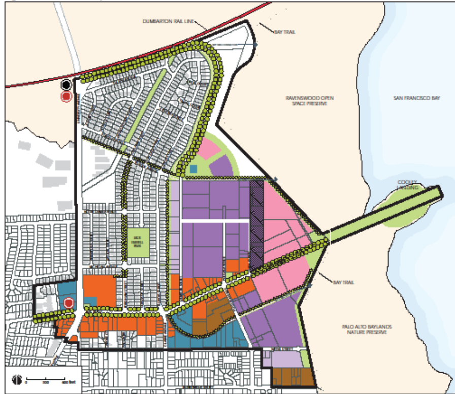
Figure 4-1: Plan Concept

* This Diagram shows a conceptual vision for future land uses in the Specific Plan area. Figure 4-1 does not represent zoning for the Specific Plan Area.