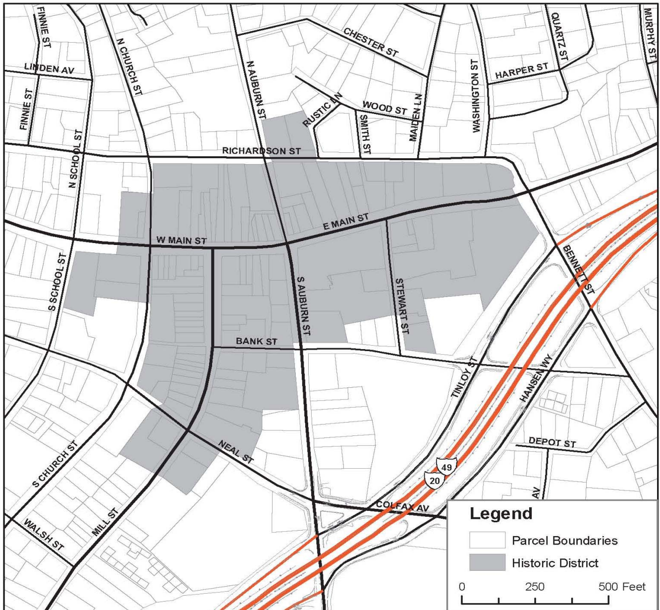
Figure III-4 Historic District

The City conducted a comprehensive review of its policies and regulations as part of the Housing Element update. The purpose was to determine whether zoning standards, permit processes, or other governmental regulations create significant constraints to reasonable accommodations for persons with disabilities. The City has noted the results of its analysis in this Chapter through the description of zoning, building, and other code standards. This review was part of the broader analysis of zoning standards and permit processes conducted for, and described in, this Housing Element. In addition, the City adopted the 2013 California