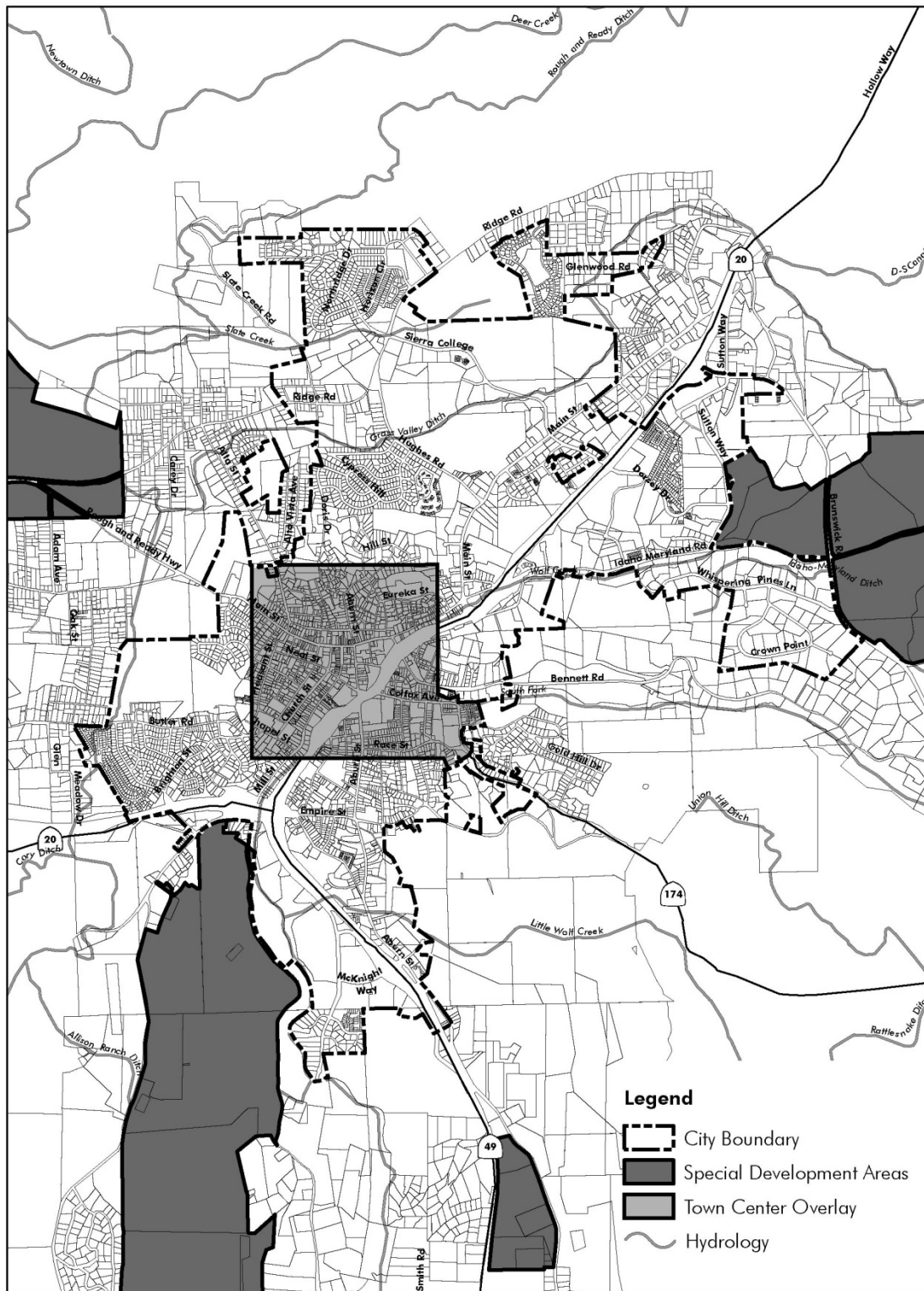
Figure III-3 Special Development Areas and Town Center Overlay