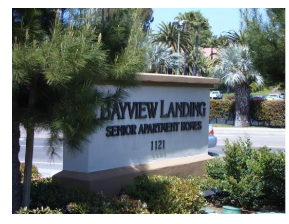
Constructed in 2004, the Bayview Landing Senior affordable housing project provides 119 units for very low - and low income seniors. The project received funds from the City's "in-lieu" housing fund reserves and tax credit financing. In addition, the City provided expedited permit processing and partial fee waivers of entitlement fees.

are comprised of the Bavview Landing (including six senior affordable housing project.accessory dwelling units). With the exception of one "manager's unit," all of the 120 units are designated This project received $1 million in funds from the City's "in-lieu" housing fund project, and units provided in compliance program, 19 percent of the net the six