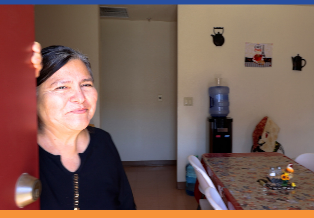
∧ A smiling resident welcomes visitors into her home at the Davis Migrant Center, known as "Ciudad Del Sol".

HCD is a statewide leader in the formation and implementation of data-driven policies and programs to address California's diverse housing and community challenges.