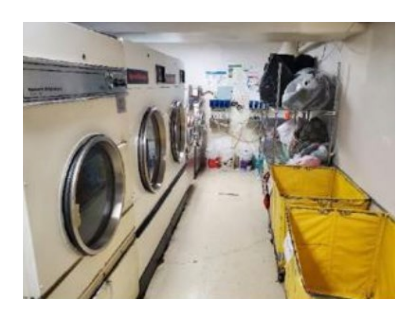
Page 9 – Relocation Narrative Template- Displacement Required – updated 2/28/2023