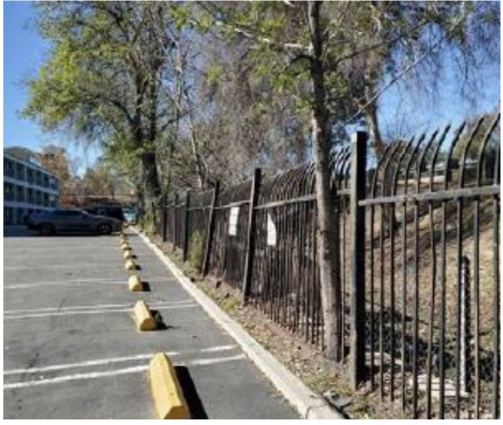
Page 7 – Relocation Narrative Template- Displacement Required – updated 2/28/2023