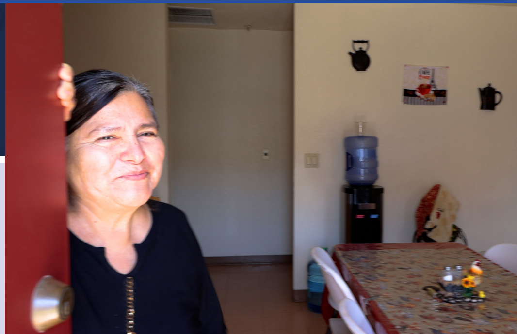
^ A smiling resident welcomes visitors into her home at the Davis Migrant Center, known as "Ciudad Del Sol".

Lead efforts to end, rather than manage, homelessness.